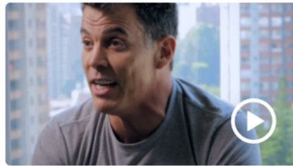
Steve-O Stunt Performer