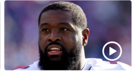
Terron Armstead NFL Player