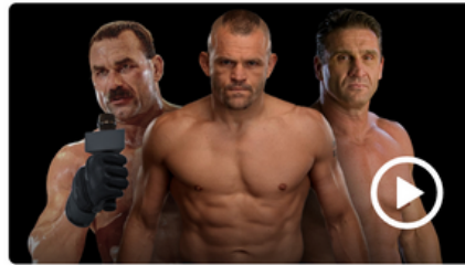
Don Frye, Chuck Liddell, Ken Shamrock UFC Legends